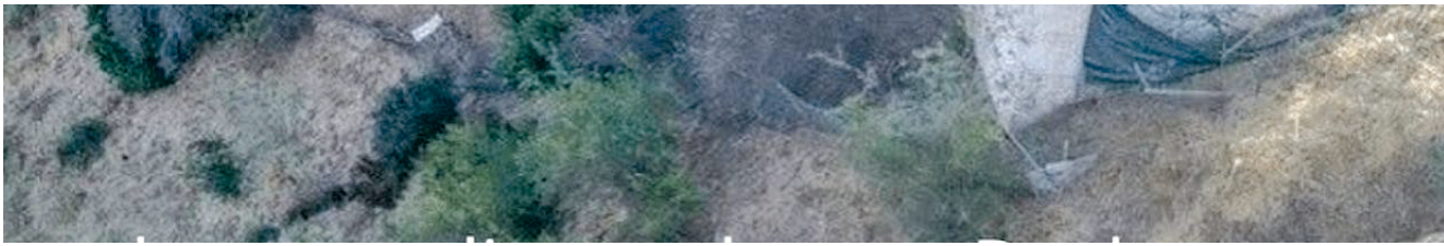
Five unfinished homes near Laurel Canyon are cited in a criminal complaint. Authorities are calling for the current owner to raze the structures.